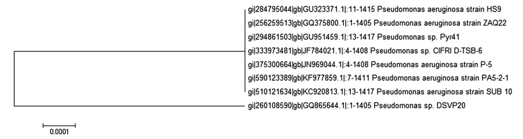
Fig. 1 Neighbour-joining phylogenetic tree of the strain DSVP20 based on 16S rRNA gene sequence comparisons and closest NCBI (BLASTn) strains based on the 16S rRNA gene sequences (neighbor-joining tree

Members of the genus Pseudomonas have a complex enzymatic system and show a wide variety of physiological and metabolic properties. Similarly, they are the most predominant group of microbes that degrade xenobiotic compounds. It is well documented that various bacteria from genus Pseudomonas, including P. aeruginosa strains, inhabit hydrocarbon-contaminated soils and can break a wide range of different organic compounds (Glick et al. 1994; Hong et al. 2005; Saikia et al. 2012; Pacwa-Płociniczak et al. 2014). They are the well-known bacteria that have the capability of utilizing a number of aliphatic and aromatic hydrocarbon compounds as a carbon and energy sources (Das and Chandran 2010; Kadali et al. 2012; Puškárová et al. 2013). Monitoring of maximum biosurfactant production and reduction in surface tension during growth of P. aeruginosa DSVP20 on pristane, eicosane, and fluoranthene at intervals of 24 h revealed that with increase in dry biomass, there was a reduction in